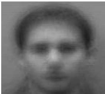
Figure 5. Average face of the Sample faces

e) Find the eigenvectors, V_{mm} and eigenvalues, \lambda_m from the C matrix using Jacobi method and ordered the eigenvectors by highest eigenvalues. Jacobi's method is chosen because its accuracy and reliability than other method.