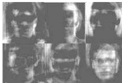
Figure 3. Eigen faces for Sample faces

3) Calculate the corresponding distribution in Dimensional weight space for each known individual, by projecting their face images on to the “face space”. (Figure 4)